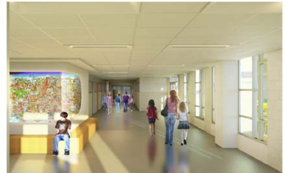
Main Entry + Main Street