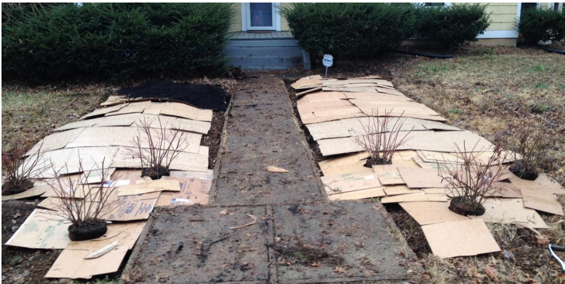
Cardboard also smothers weeds but breaks down over time