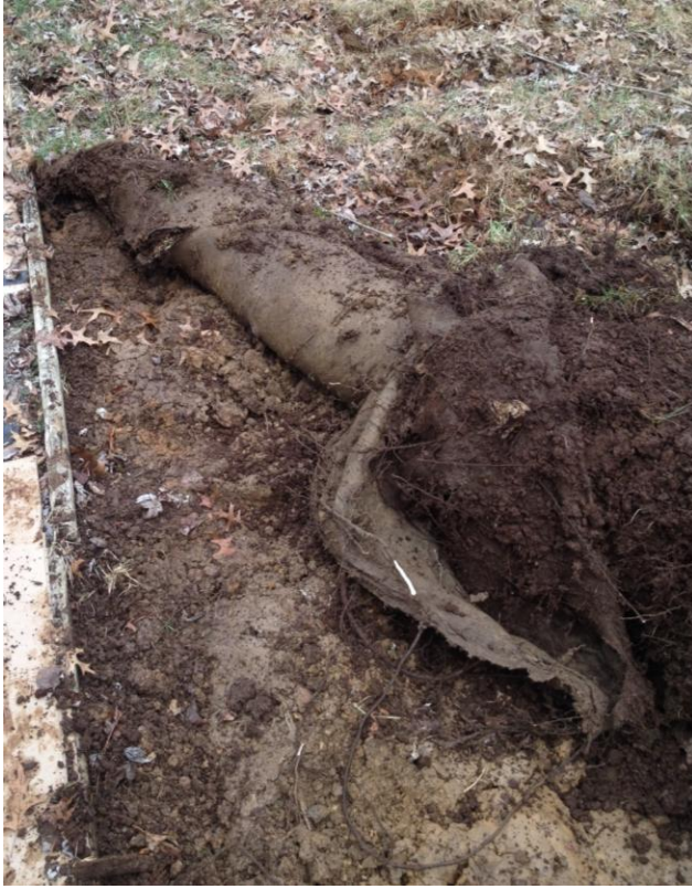
Ten year old weed fabric with a thick layer of weeds growing on top