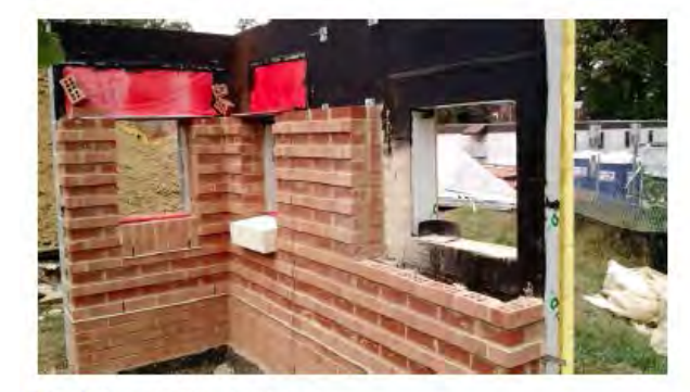
Mock Up wall in progress