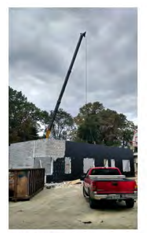
Roof joist installation at Area B