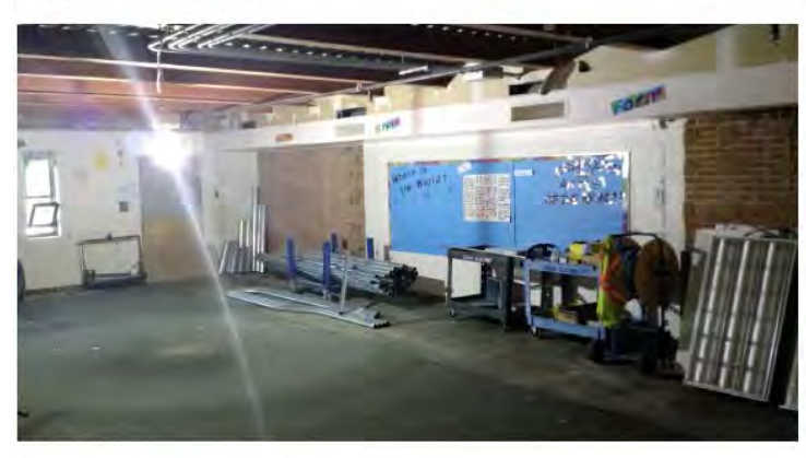
Old music room gone, new work under construction