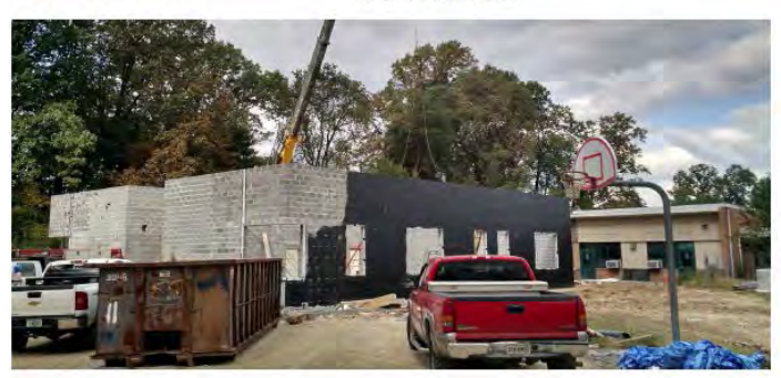
Area B construction