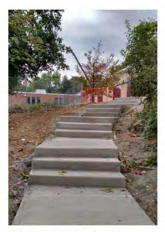
New concrete steps to the Relocatables