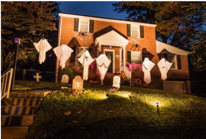
Adult Category: The Lewis Family at 1108 N. Powhatan